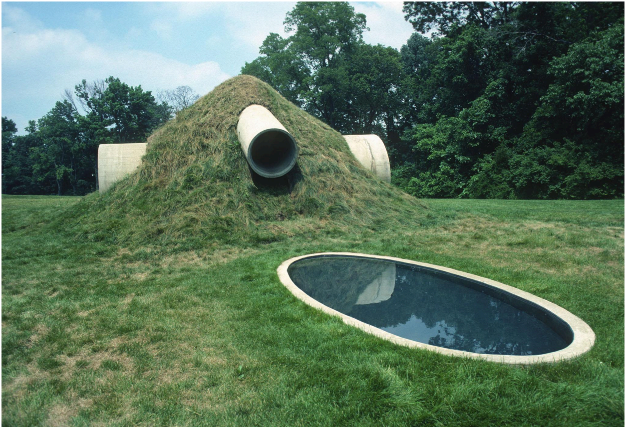
- Star Crossed